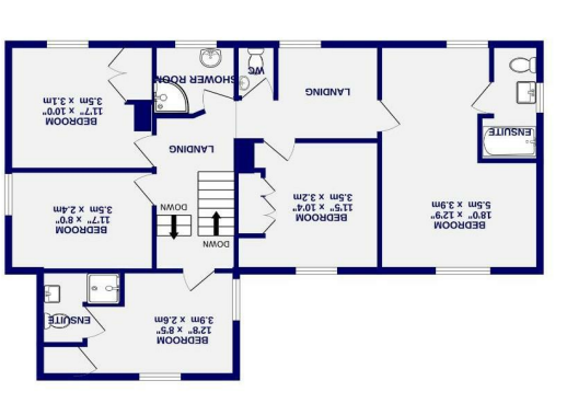
1ST FLOOR sq.ft. (82.3 sq.m.) approx.