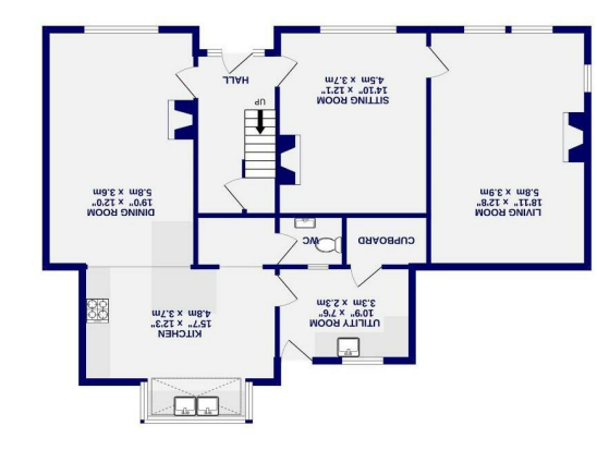
GROUND FLOOR 1038 sq.ft. (96.5 sq.m.) approx.