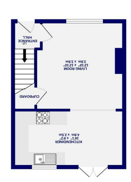
GROUND FLOOR 333 sq.ft. (31.0 sq.m.) approx.