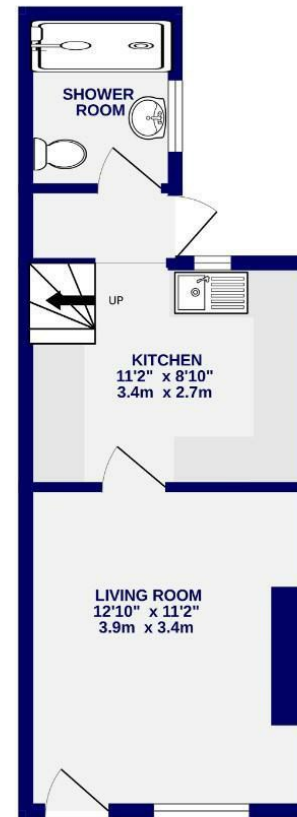
GROUND FLOOR 293 sq.ft. (27.2 sq.m.) approx.