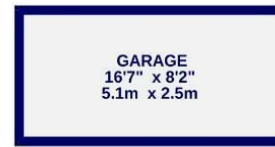
GROUND FLOOR 523 sq.ft. (48.6 sq.m.) approx.