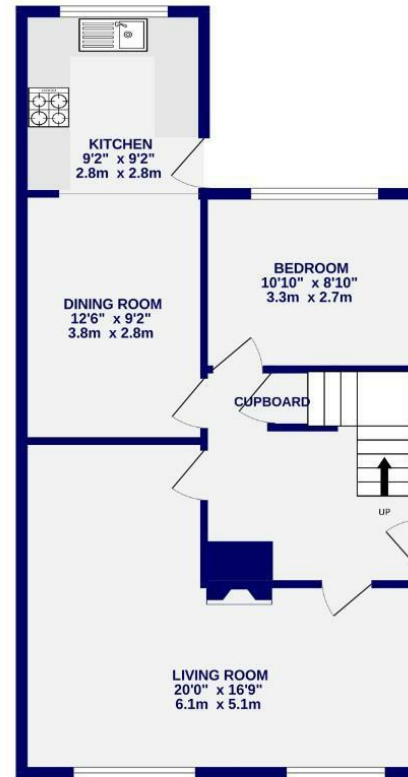
1ST FLOOR 471 sq.ft. (43.8 sq.m.) approx.