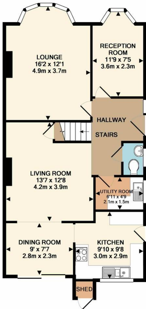
GROUND FLOOR APPROX. FLOOR AREA 711 SQ.FT. (66.1 SQ.M.)