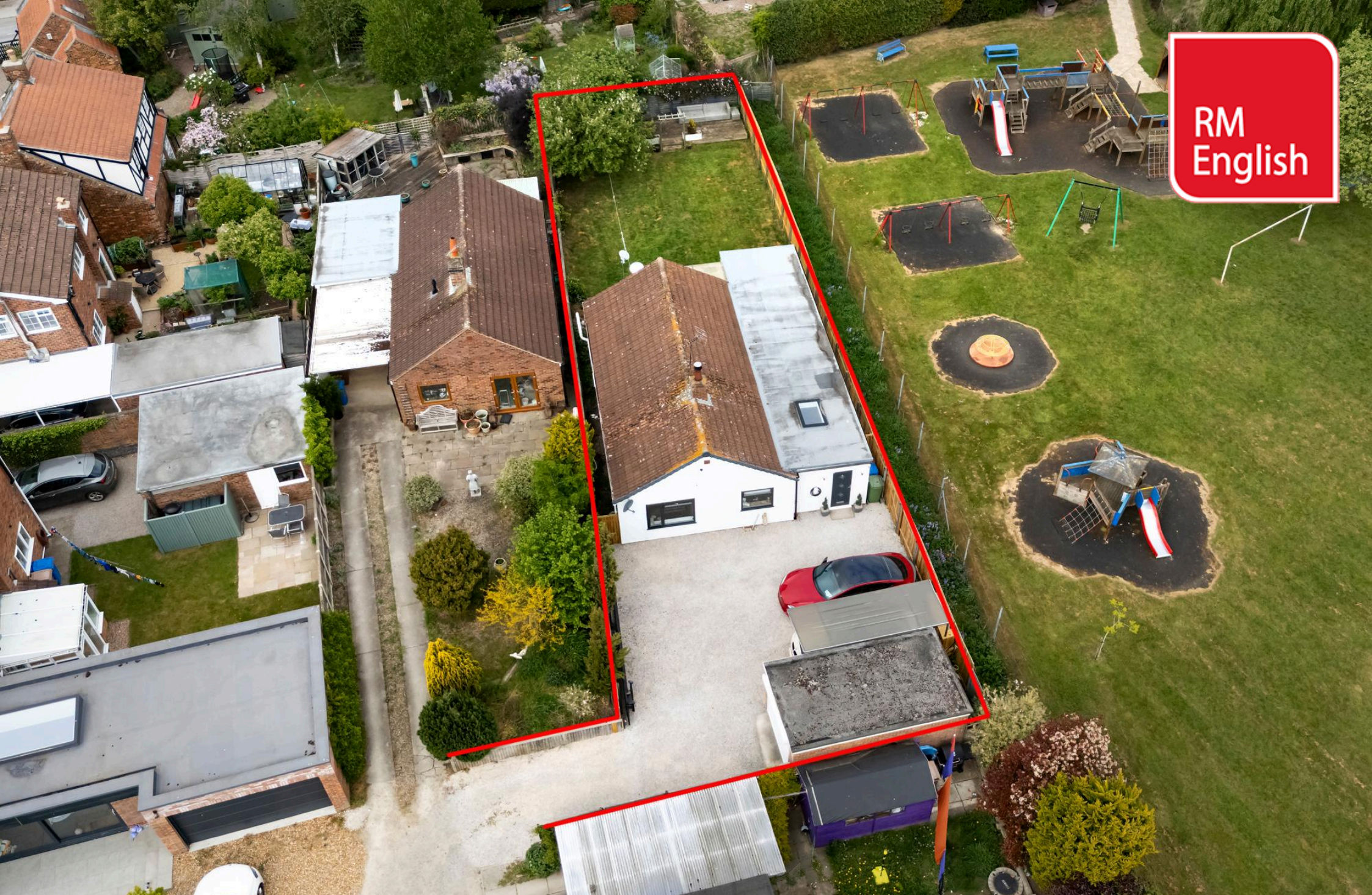
Derwent Park Close, Sutton On Derwent, York, YO41 4BQ