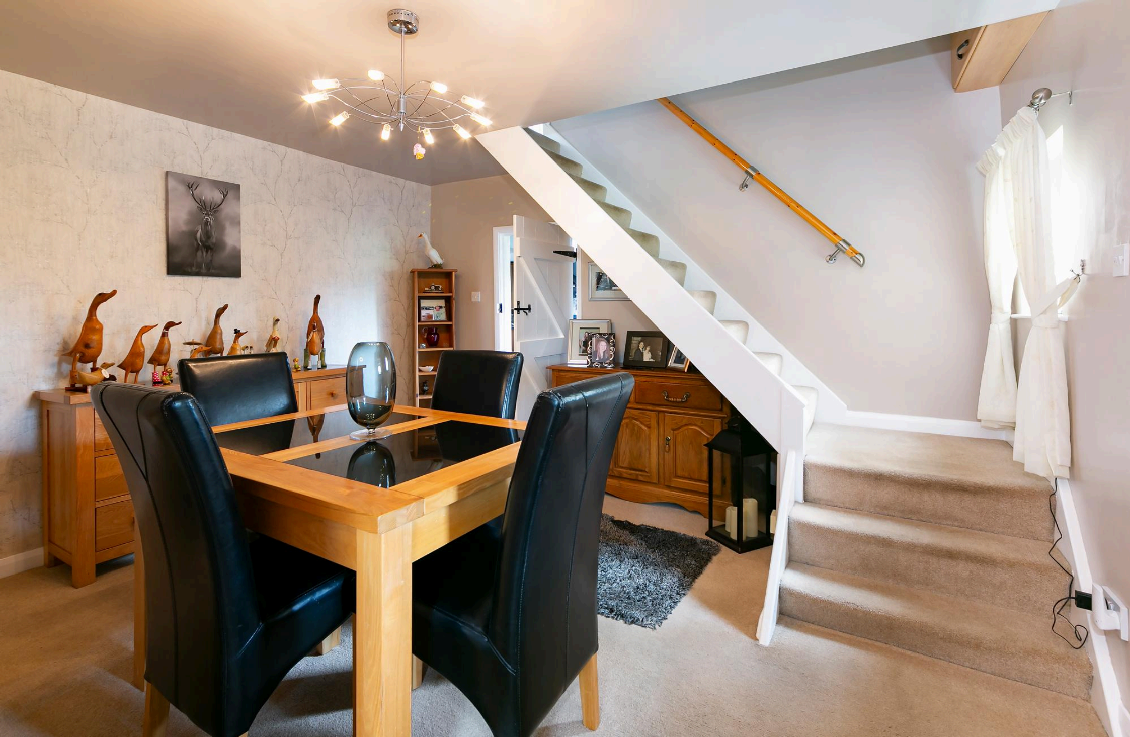
A DESIRABLE FAMILY HOME WITH A RANGE OF OUTBUILDINGS