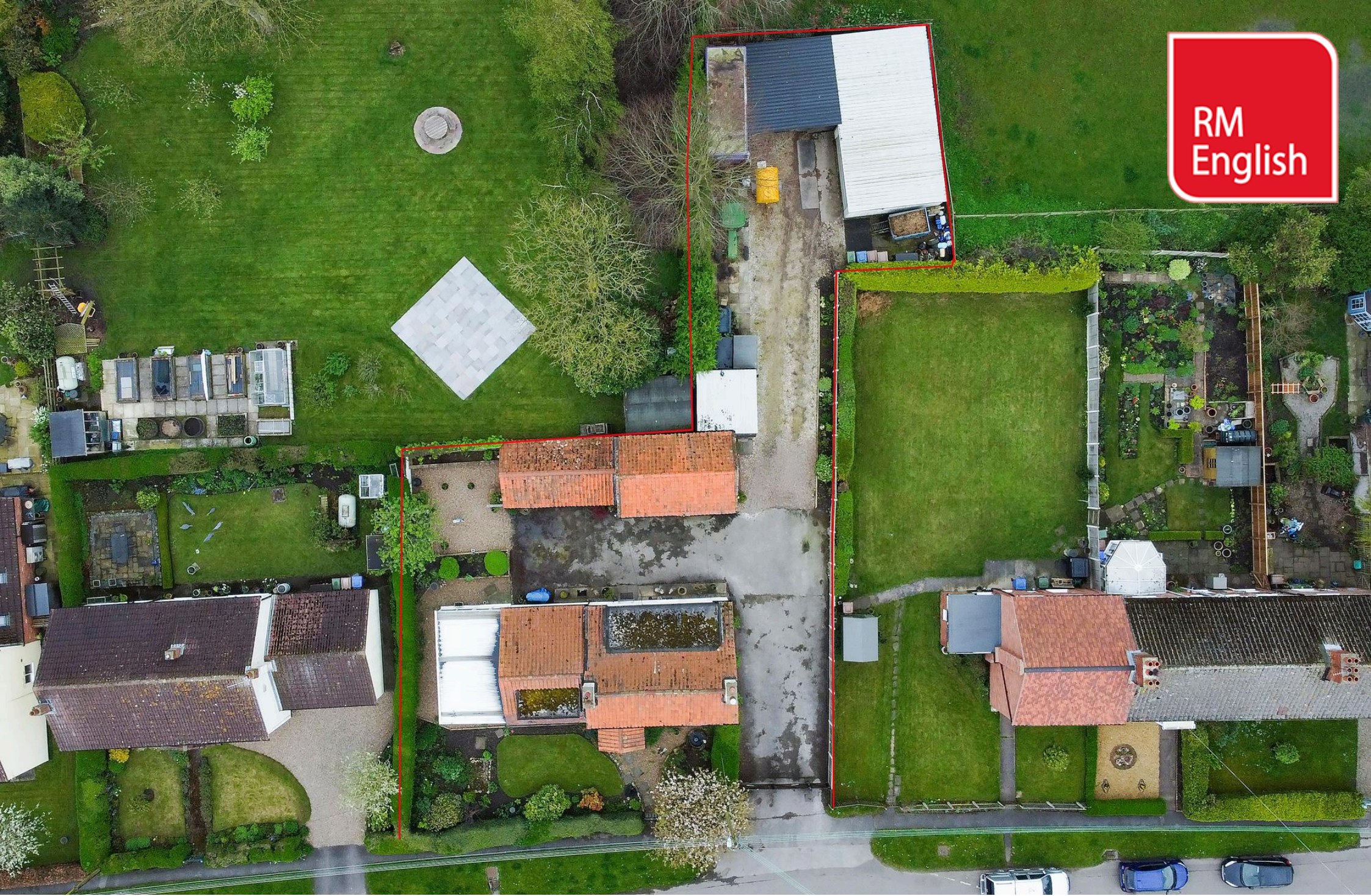
Main Street, Ellerton, York, YO42 4NX