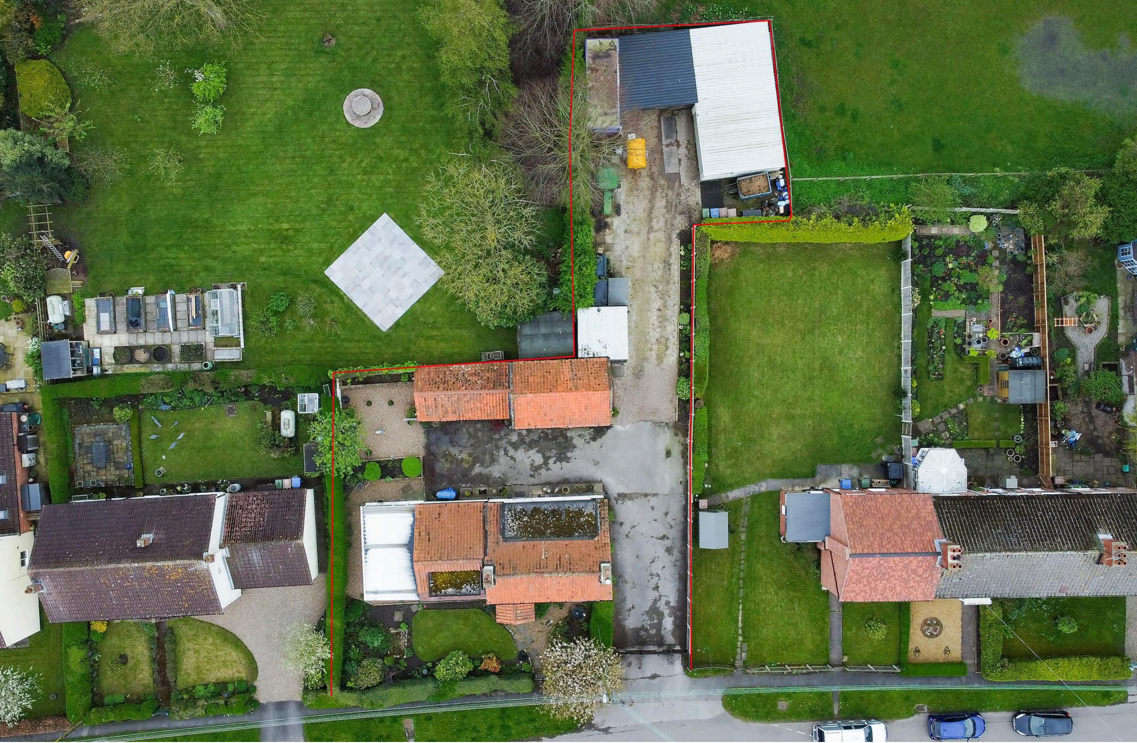
A DESIRABLE FAMILY HOME WITH A RANGE OF OUTBUILDINGS