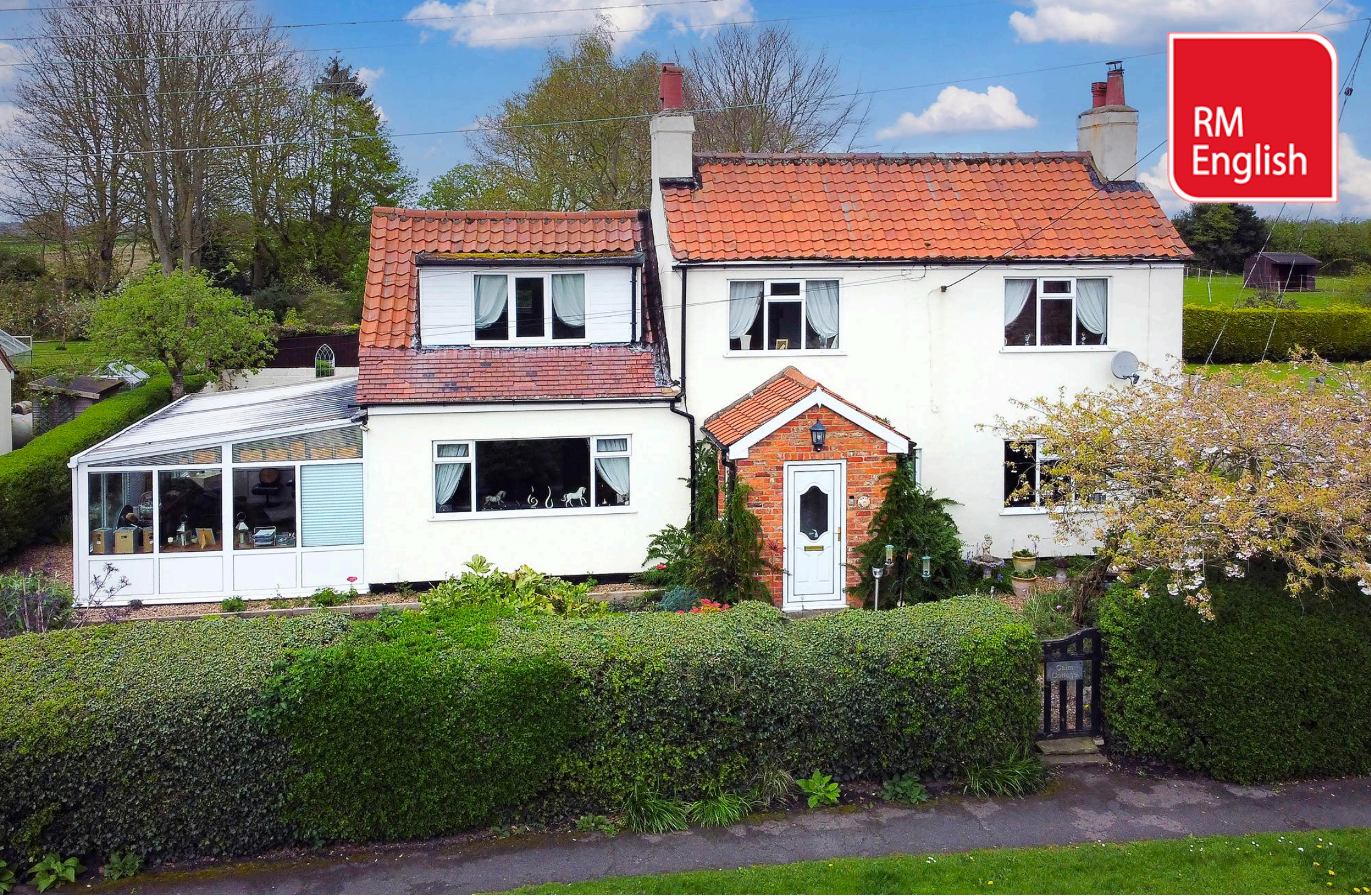
Main Street, Ellerton, York, YO42 4NX