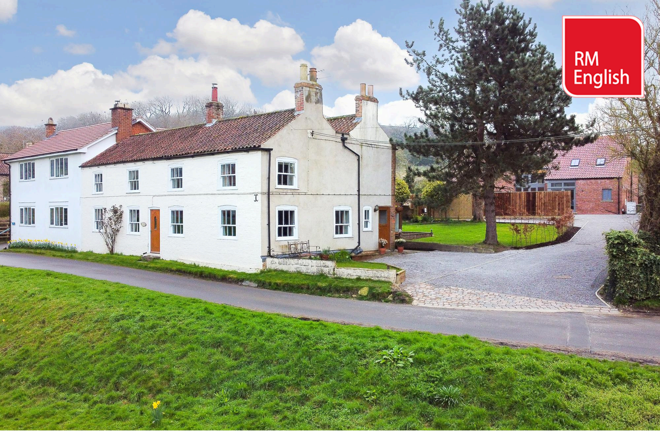
Main Street, Bishop Wilton, York