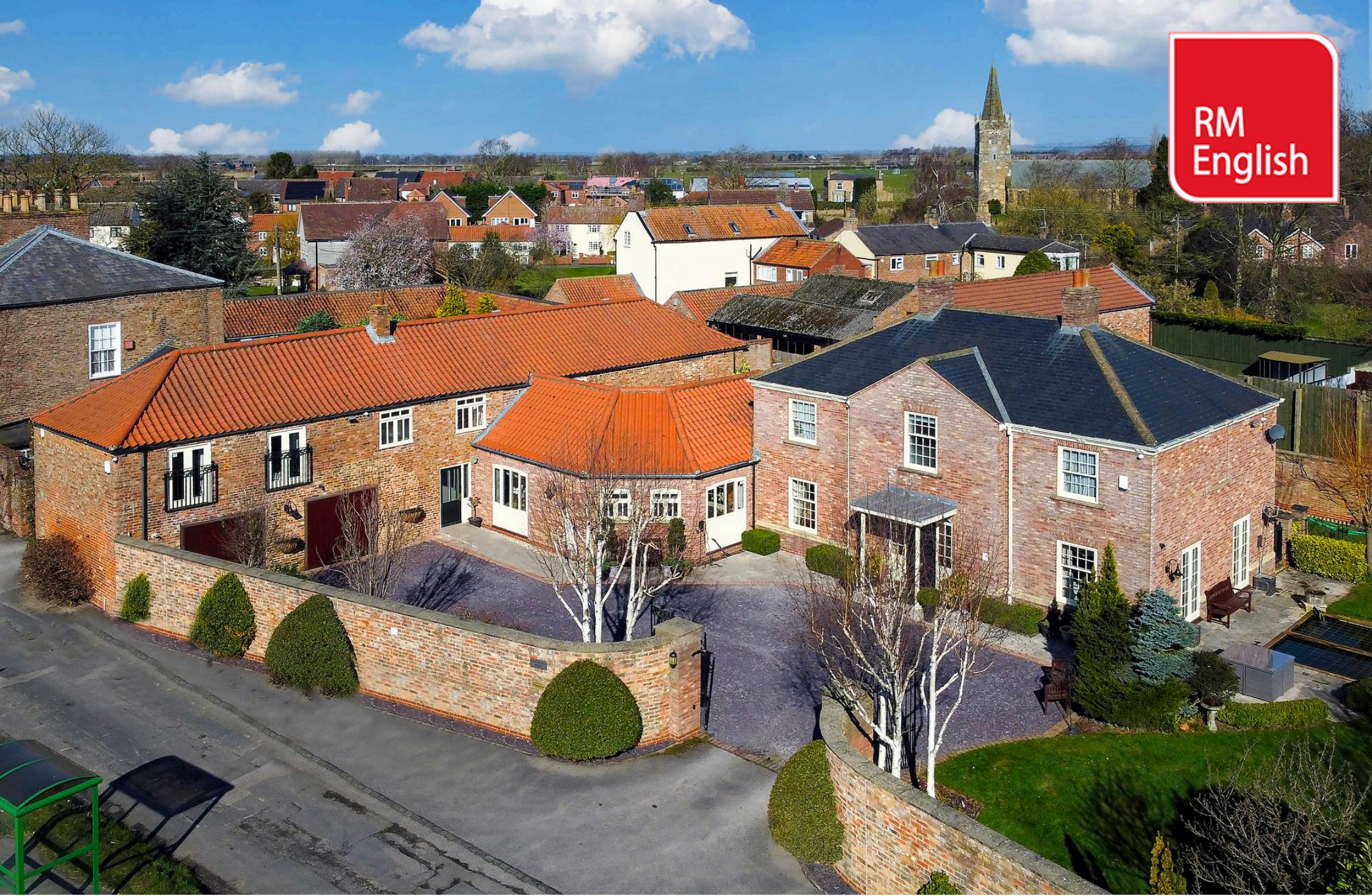
Constantine House, Hull Road, Barmby Moor, York, YO42 4EZ