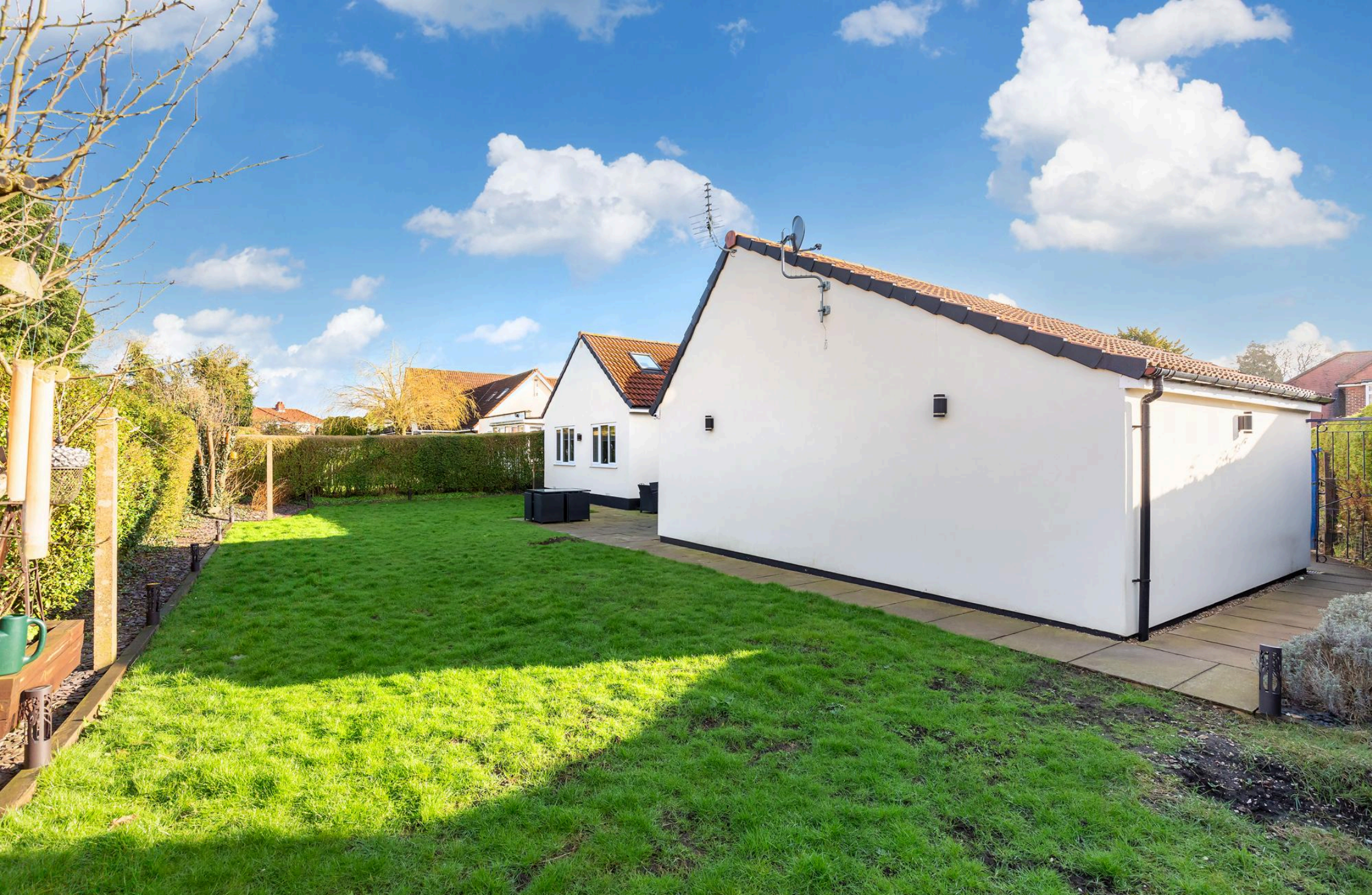
SPACIOUS FAMILY HOME WITH LARGE GARDEN