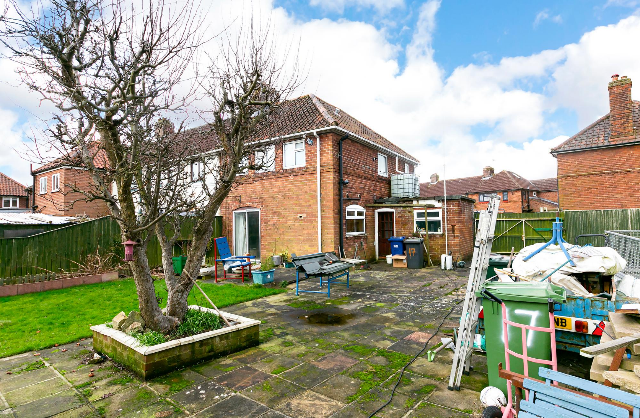
LARGE CORNER PLOT WITH POTENTIAL TO EXTEND