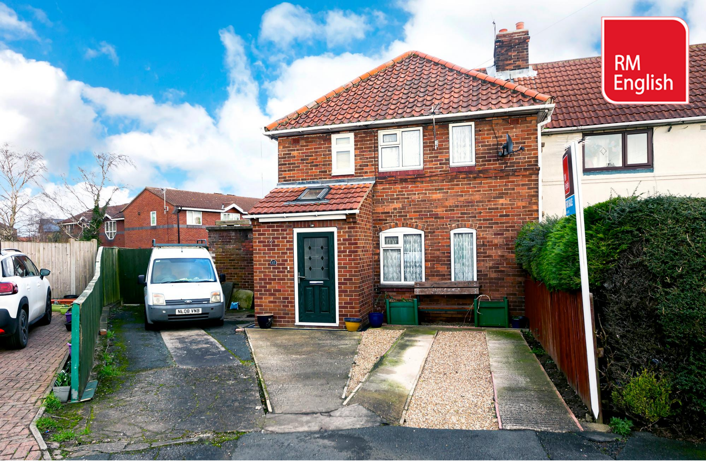
17 Grange Road, Tadcaster, North Yorkshire, LS24 8AL