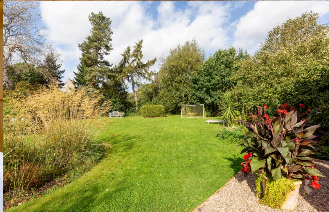
Hull Road, Wilberfoss, York, YO41 5PD