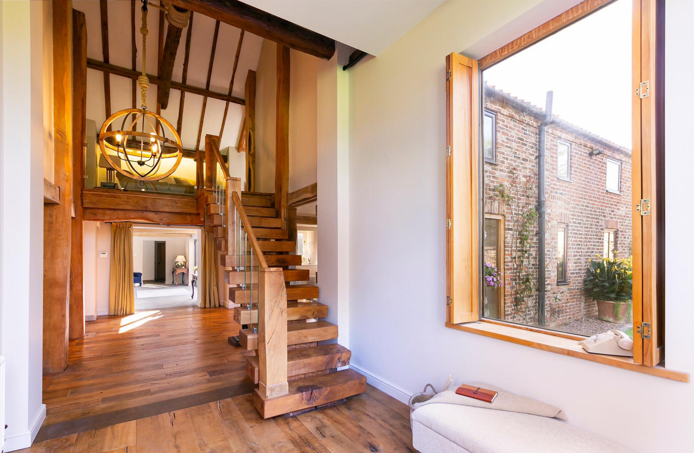
A TRULY STUNNING FAMILY HOME WITH A SUBSTANTIAL MATURE GARDEN