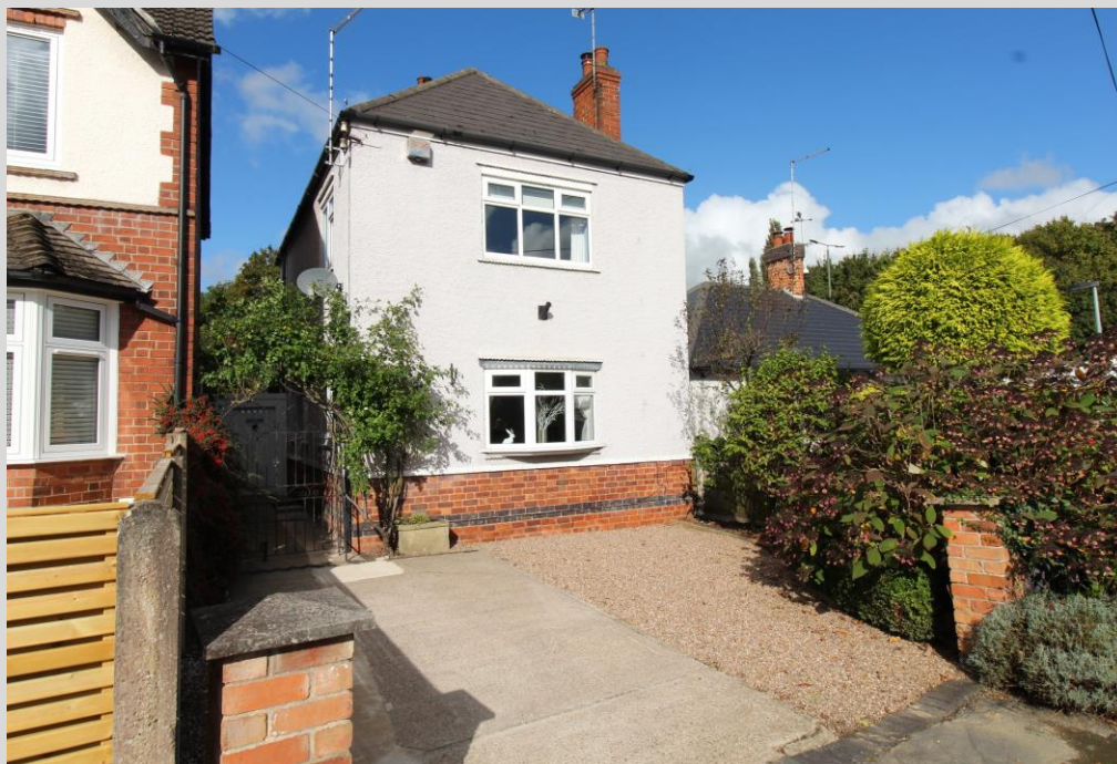
227 Victoria Avenue, Borrowash Derby, DE72 3HG

Extended detached property with three reception rooms, two bedrooms and a beautiful rear garden with patio door form a delighting snug at the rear. This fantastic period home which oozes charm and character has a very spacious footprint, including a dining room which is open plan to the snug, a large formal sitting room with a log burner effect gas fire and a modern kitchen with a ground floor WC off. On the first floor is a roomy light, bright and airy master bedroom with a cast iron feature fireplace, a spacious three piece shower room and a good size second bedroom with a recessed fitted wardrobe. The property occupies a very spacious plot with off road parking to the front and a very private landscaped garden to the rear. It is located in a very convenient position within walking distance of Borrowash village centre in one direction and the village of Ockbrook in the other.