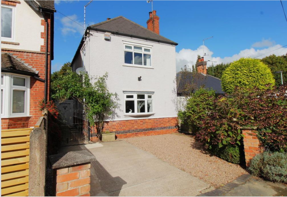
227 Victoria Avenue, Borrowash Derby, DE72 3HG

Extended detached property with three reception rooms, two bedrooms and a beautiful rear garden with patio door form a delighting snug at the rear. This fantastic period home which oozes charm and character has a very spacious footprint, including a dining room which is open plan to the snug, a large formal sitting room with a log burner effect gas fire and a modern kitchen with a ground floor WC off. On the first floor is a roomy light, bright and airy master bedroom with a cast iron feature fireplace, a spacious three piece shower room and a good size second bedroom with a recessed fitted wardrobe. The property occupies a very spacious plot with off road parking to the front and a very private landscaped garden to the rear. It is located in a very convenient position within walking distance of Borrowash village centre in one direction and the village of Ockbrook in the other.