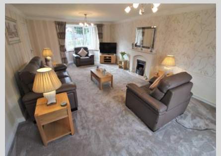
42 Collier Lane, Ockbrook Derby, DE72 3RP

Immaculate four double bedroom detached house in an established and ever improving location within the sought after village of Ockbrook. The property has been lavished by its current owners with superb quality fittings throughout, including having had both the kitchen and bathroom fitted by Creative Interiors. To the rear is a good size and beautifully maintained level garden with an open aspect beyond, whilst to the front of the property is a large sweeping block paved driveway which provides off road parking for several vehicles and give access to the double garage via a remote controlled electric door. The accommodation of this fantastic family home is UPVC double glazed, gas centrally heated via a recent Worcester Bosch combination boiler and includes a separate dining room, a UPVC double glazed conservatory plus a utility room and WC.