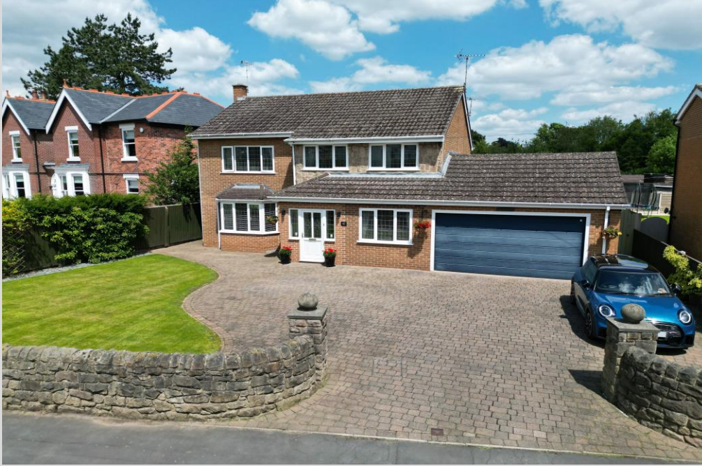
42 Collier Lane, Ockbrook Derby, DE72 3RP

Immaculate four double bedroom detached house in an established and ever improving location within the sought after village of Ockbrook. The property has been lavished by its current owners with superb quality fittings throughout, including having had both the kitchen and bathroom fitted by Creative Interiors. To the rear is a good size and beautifully maintained level garden with an open aspect beyond, whilst to the front of the property is a large sweeping block paved driveway which provides off road parking for several vehicles and give access to the double garage via a remote controlled electric door. The accommodation of this fantastic family home is UPVC double glazed, gas centrally heated via a recent Worcester Bosch combination boiler and includes a separate dining room, a UPVC double glazed conservatory plus a utility room and WC.