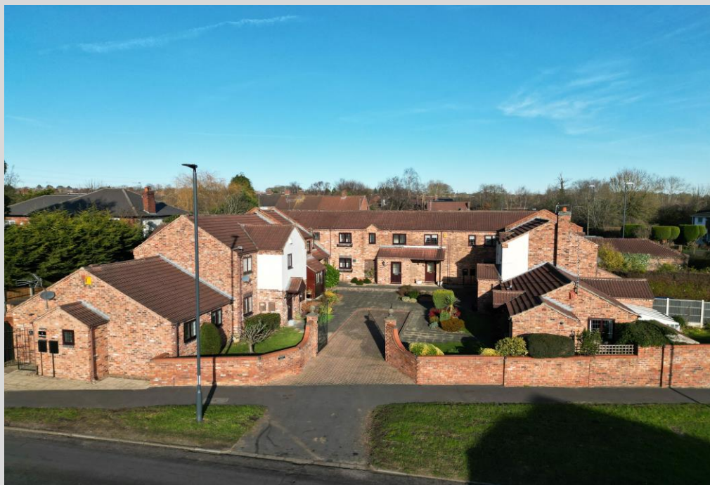
1 Burrowfield Mews Nottingham Road, Spondon Derby, DE21 7SJ

NO UPWARD CHAIN. A fabulous one bedroom bungalow situated in a beautiful mews style development within a short stroll of bus links between Derby and Nottingham. The property has been completely renovated and maintained by the current owners who have created a wonderful, stylish and modern home. There is parking and a brick built garage to the rear of the development and a very private low maintenance rear garden with a covered terrace, raised brick planters and an artificial lawn. Internally the property is finished to a high standard with a modern fitted kitchen, stylish shower room and a good size lounge/diner with two sets of patio doors which lead out to the garden. All of the windows are UPVC double glazed and there is a gas combination boiler fuelling the central heating and hot water.