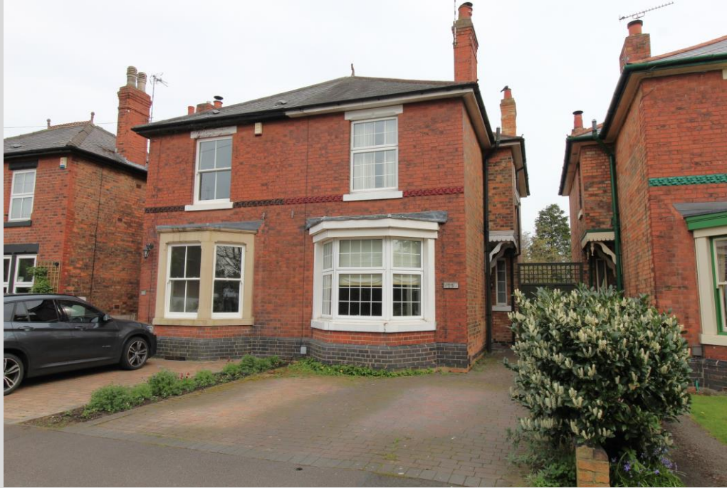
25 Gordon Road, Borrowash Derby, DE72 3JX

Situated on a quiet one way street just off the village centre, is this fabulous three double bedroom late Victorian house with off road parking for two vehicles and side access to a very private south east facing rear garden. Many features commensurate with the period of construction are in evidence, such as Minton tiled flooring, coved ceilings with centre roses, picture rails and stained glass. There is UPVC double glazed windows throughout and a gas central heating system fuelled via a combination boiler. Both reception rooms are a very good size, there is a spacious kitchen diner and a large L shaped central hallway with a stunning Minton tiled floor covering. The property is also within a short walk of Elvaston Castle Country Park plus there are excellent bus links between the cities of both Derby and Nottingham.