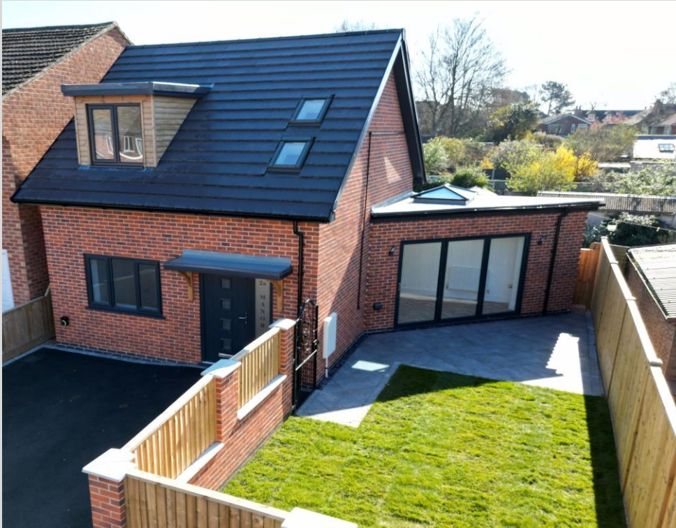
2a Manor Park, Borrowash Derby, DE72 3LP

Beautifully constructed, quality newly built detached property in a cul-de-sac location within an extremely short walk of the bustling village centre. Easy access to a frequent bus service to the centres of both Derby and Nottingham and a few minutes walk from the stunning parkland at Elvaston Castle country park. This versatile property could be used as a bungalow with a guest suite on the first floor or simply as a two bedroom house. There are two bathrooms, one of which is on the ground floor, a fabulous living kitchen with bi fold doors out onto the level garden and parking at the front for two vehicles. Ready for immediate occupation.