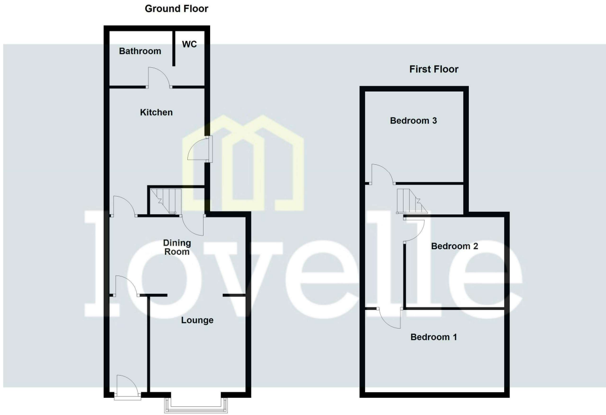
Haven Avenue, Grimsby