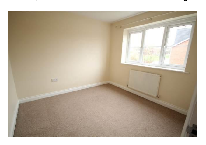
BEDROOM 3: 7' 4" x 6' 8" (2.24m x 2.03m) Radiator and double glazed window.

BEDROOM 2: 9' 7" x 9' 3" (2.92m x 2.82m) Radiator and double glazed window.