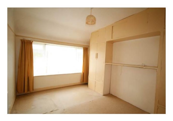
BEDROOM 3:9' 4" x 6' (2.84m x 1.83m) Radiator and double glazed window.

BEDROOM 2: 12' 4" x 8' 5" (3.76 m x 2.57 m) Radiator and double glazed window. Fitted wardrobe/storage.