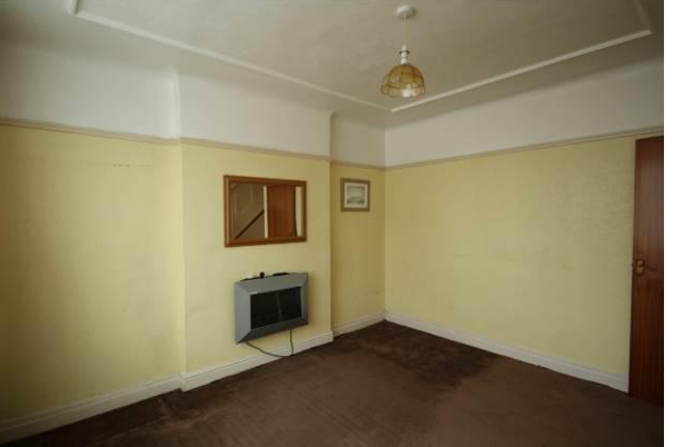
DINING ROOM: 12'5" \times 10'7" (3.78m \times 3.23m) Radiator and double glazed window. Gas fire (not working capped)