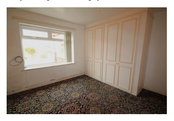
BEDROOM 2: 9' 9" x 8' 8" (2.97m x 2.64m) Radiator and double glazed window.