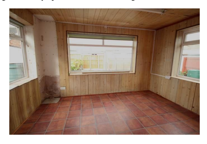
BEDROOM 1:11'8" x 11'5" (3.56m x 3.48m) Radiator and double glazed window. Fitted wardrobe with radiator providing useful airing space.

DINING ROOM/SUN ROOM 12' 4" x 9' 5" (3.76m x 2.87m) 3 Double glazed windows making this a bright and airy space. Wall mounted gas boiler and double glazed rear exit.