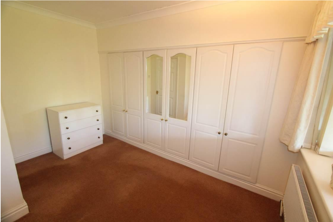
BEDROOM 2: 9' x 8' (2.74m x 2.44m) Panelled radiator. Fitted range of 4 door wardrobe facilities. Window to side elevation.