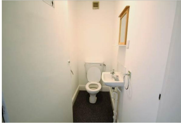
GENTS W.C: Electric panel heater.