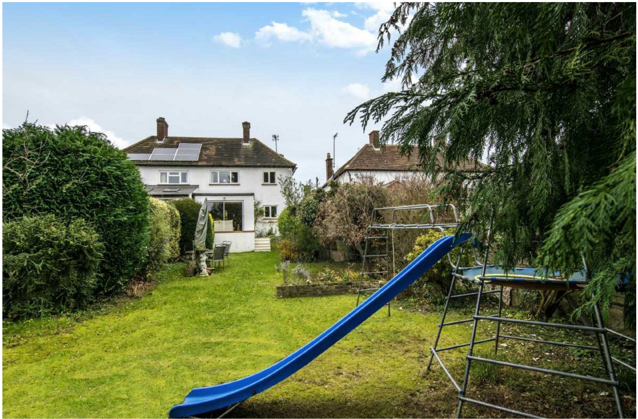
70 Fore Street, Hertford, Hertfordshire, SG14 1BY 01992 303300