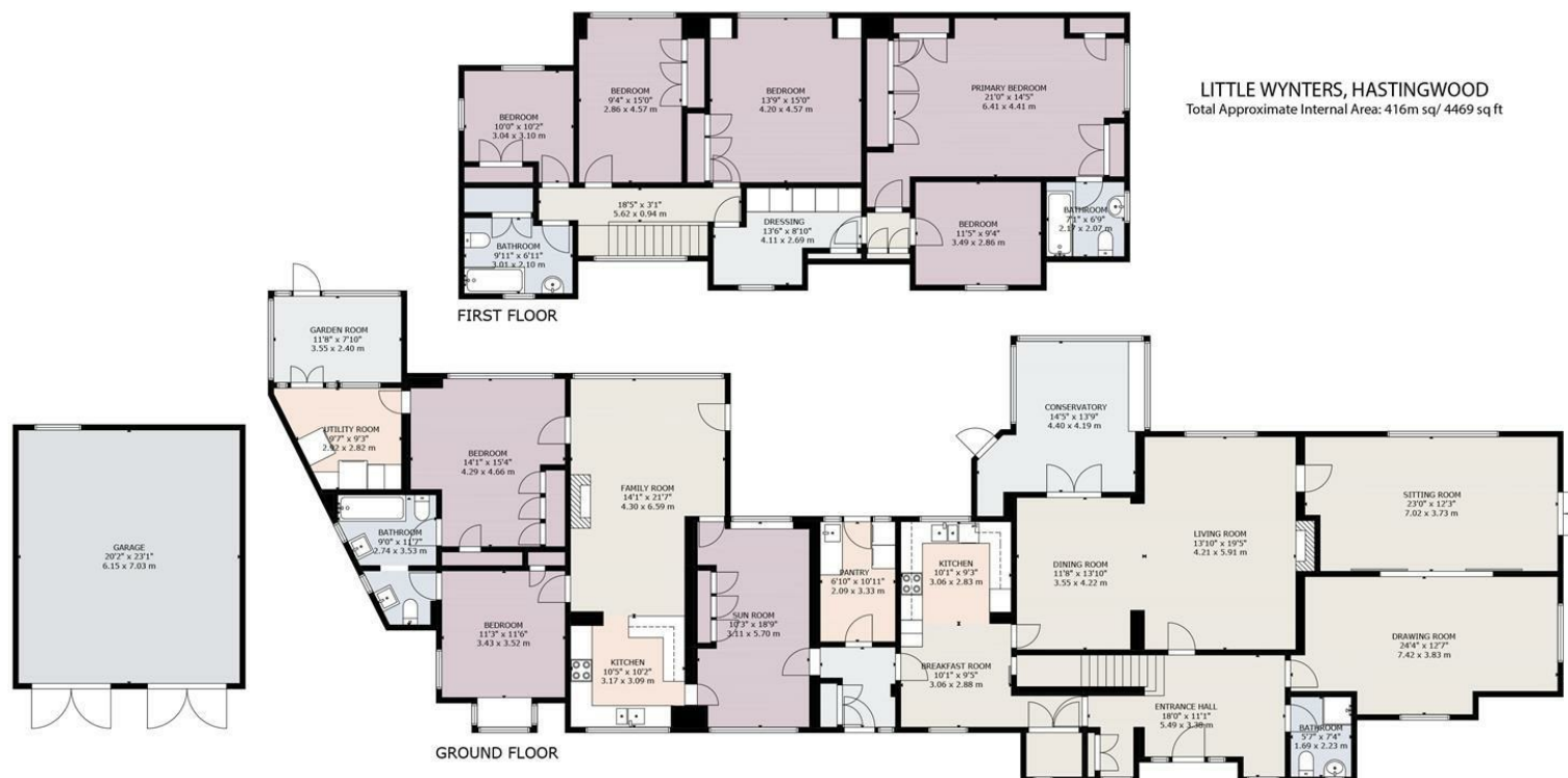
LITTLE WYNTERS, HASTINGWOOD Total Approximate Internal Area: 416m sq/ 4469 sq ft

EXCLUDED AREAS: GARAGE: 43 m 2 /466 sq ft SIZE AND DIMENSIONS ARE APPROXIMATE, ACTUAL MAY VARY