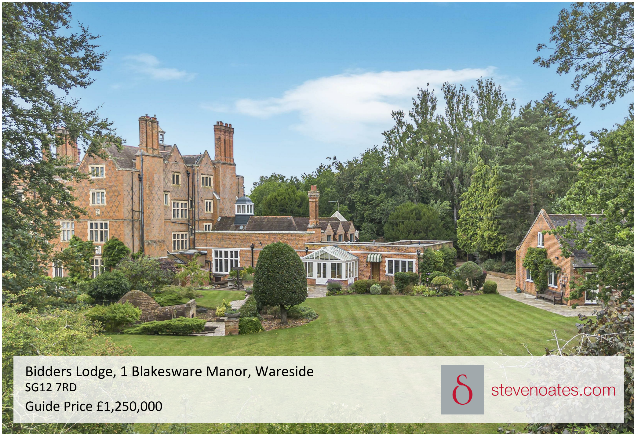
Bidders Lodge, 1 Blakesware Manor, Wareside SG12 7RD Guide Price £1,250,000