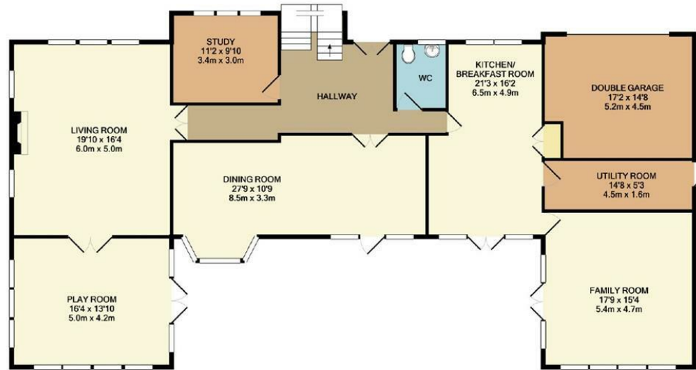
GROUND FLOOR APPROX. FLOOR AREA 1874 SQ.FT. (174.1 SQ.M.)