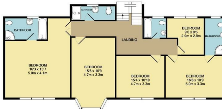
1ST FLOOR APPROX. FLOOR AREA 1139 SQ.FT. (105.8 SQ.M.)

TOTAL APPROX. FLOOR AREA 3013 SQ.FT. (279.9 SQ.M.)