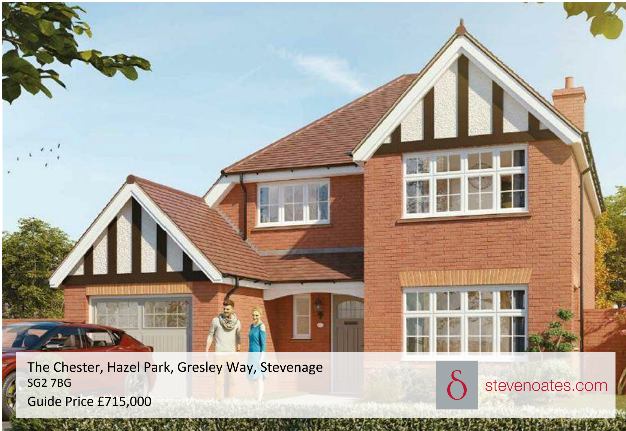
The Chester, Hazel Park, Gresley Way, Stevenage SG2 7BG Guide Price £715,000