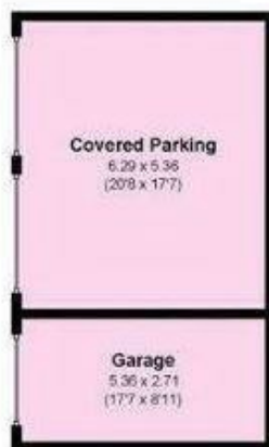
Garage Approx. 49.0 sq. metres (527.43 sq. feet)