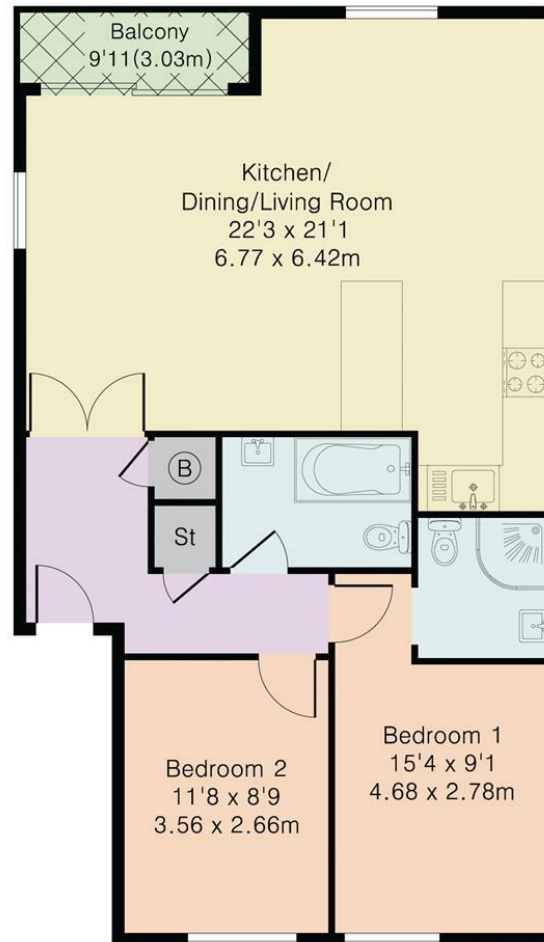
Second Floor Flat

Approximate Gross Internal Area 783 sq ft - 73 sq m