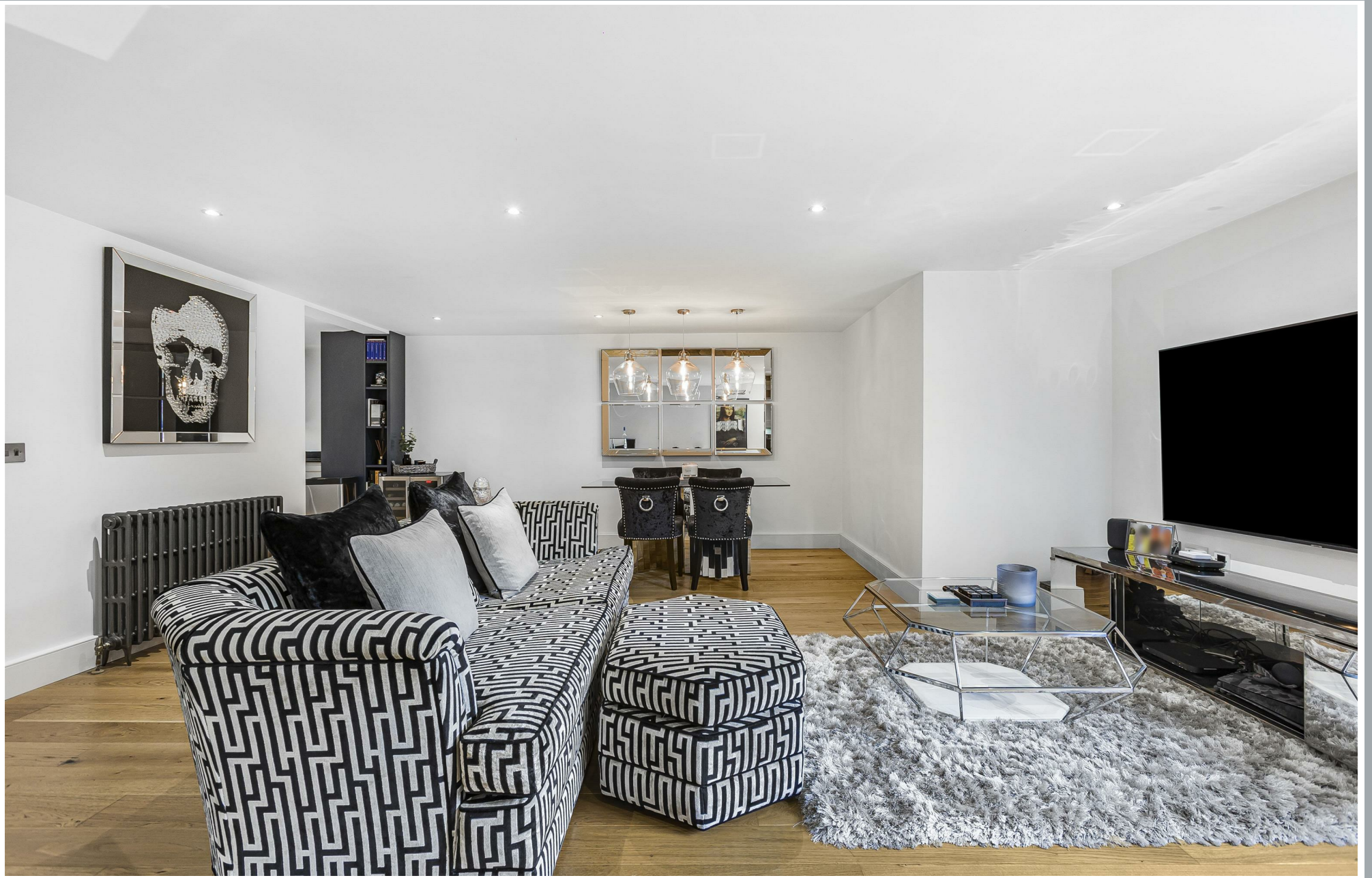
70 Fore Street, Hertford, Hertfordshire, SG14 1BY