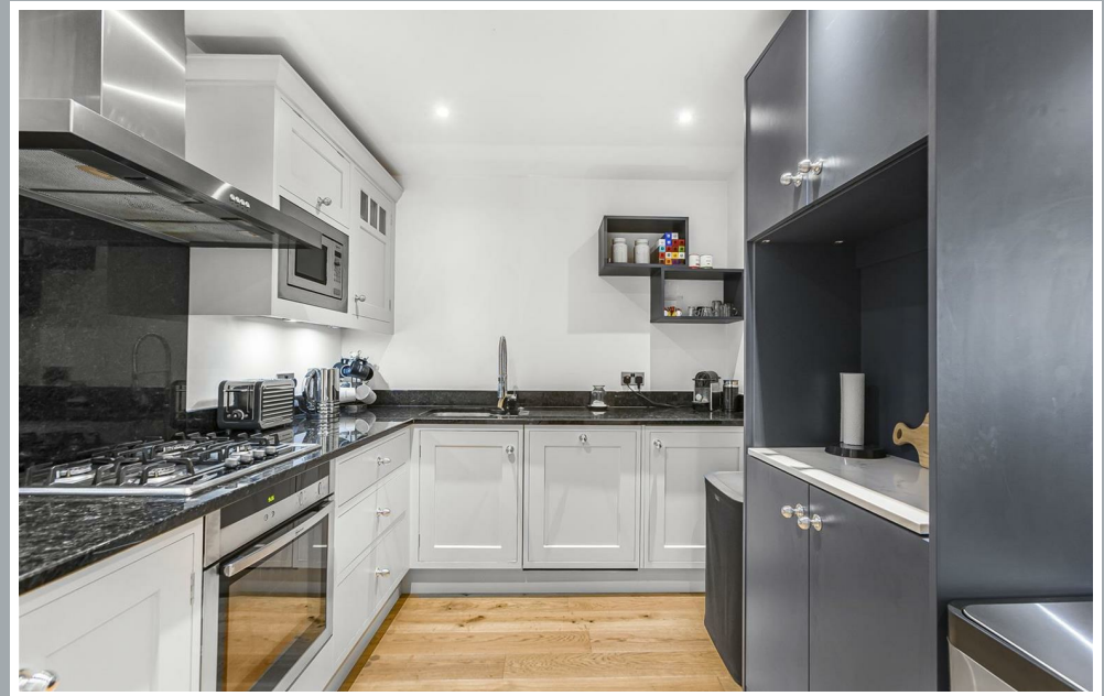
70 Fore Street, Hertford, Hertfordshire, SG14 1BY