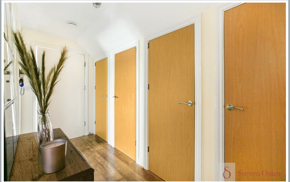
70 Fore Street, Hertford, Hertfordshire, SG14 1BY