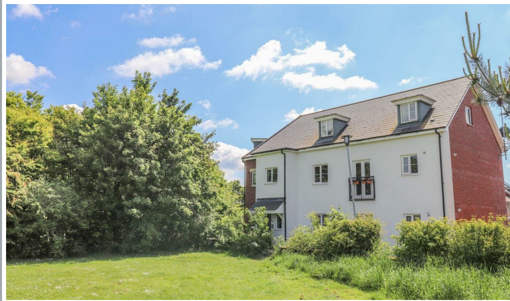
70 Fore Street, Hertford, Hertfordshire, SG14 1BY