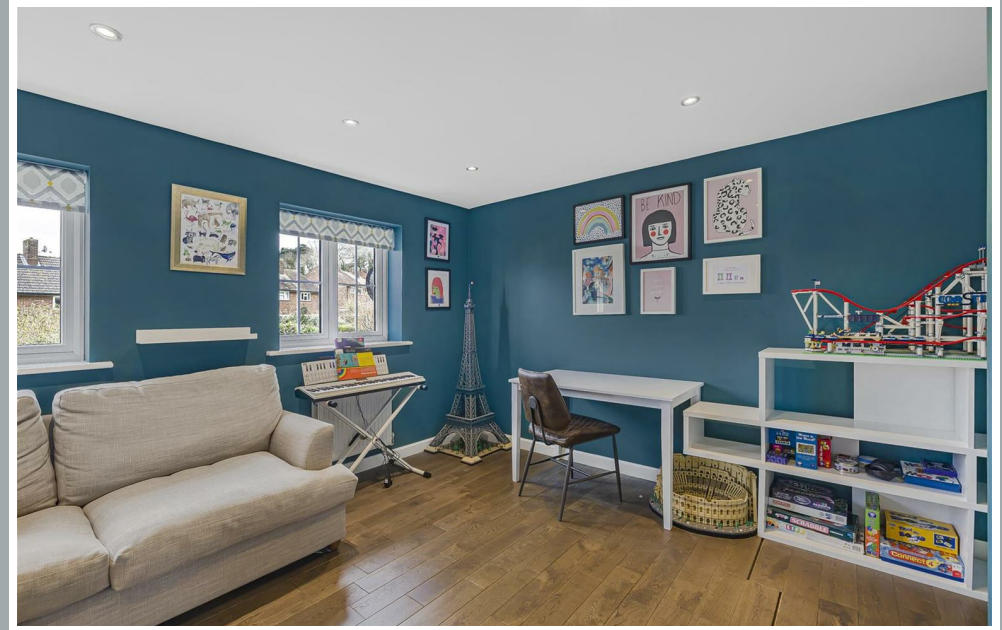
70 Fore Street, Hertford, Hertfordshire, SG14 1BY