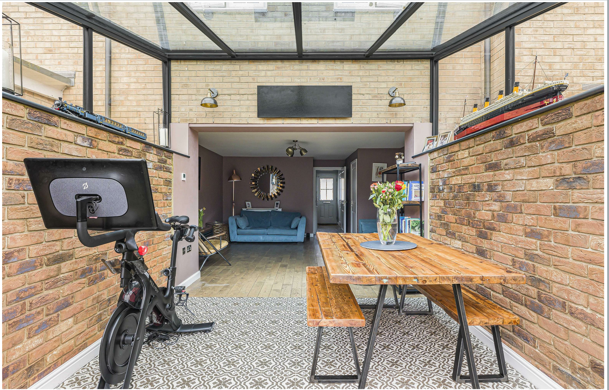
70 Fore Street, Hertford, Hertfordshire, SG14 1BY