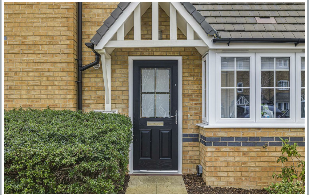
70 Fore Street, Hertford, Hertfordshire, SG14 1BY