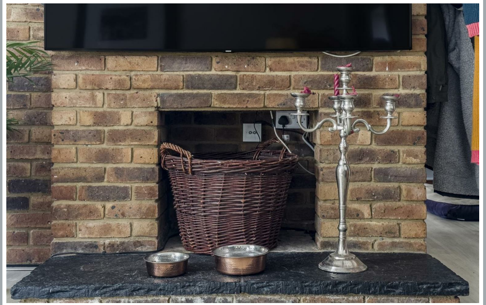
70 Fore Street, Hertford, Hertfordshire, SG14 1BY