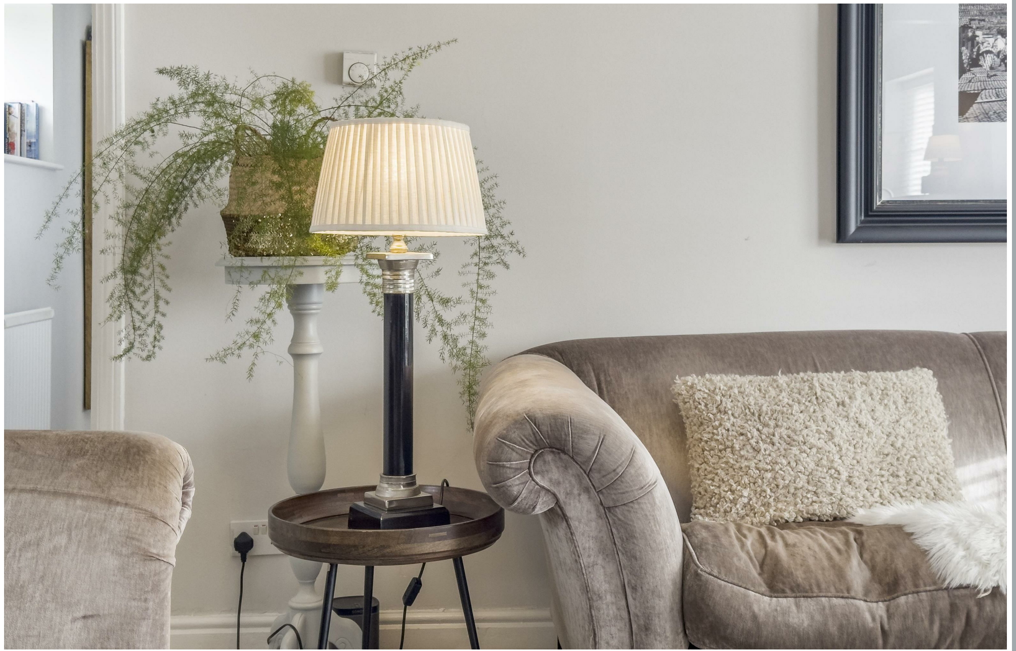
70 Fore Street, Hertford, Hertfordshire, SG14 1BY