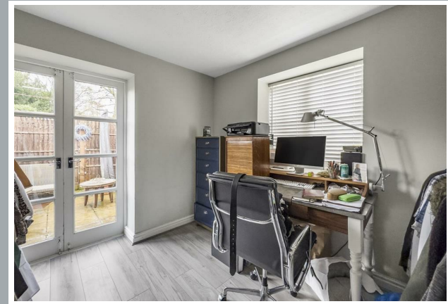
70 Fore Street, Hertford, Hertfordshire, SG14 1BY