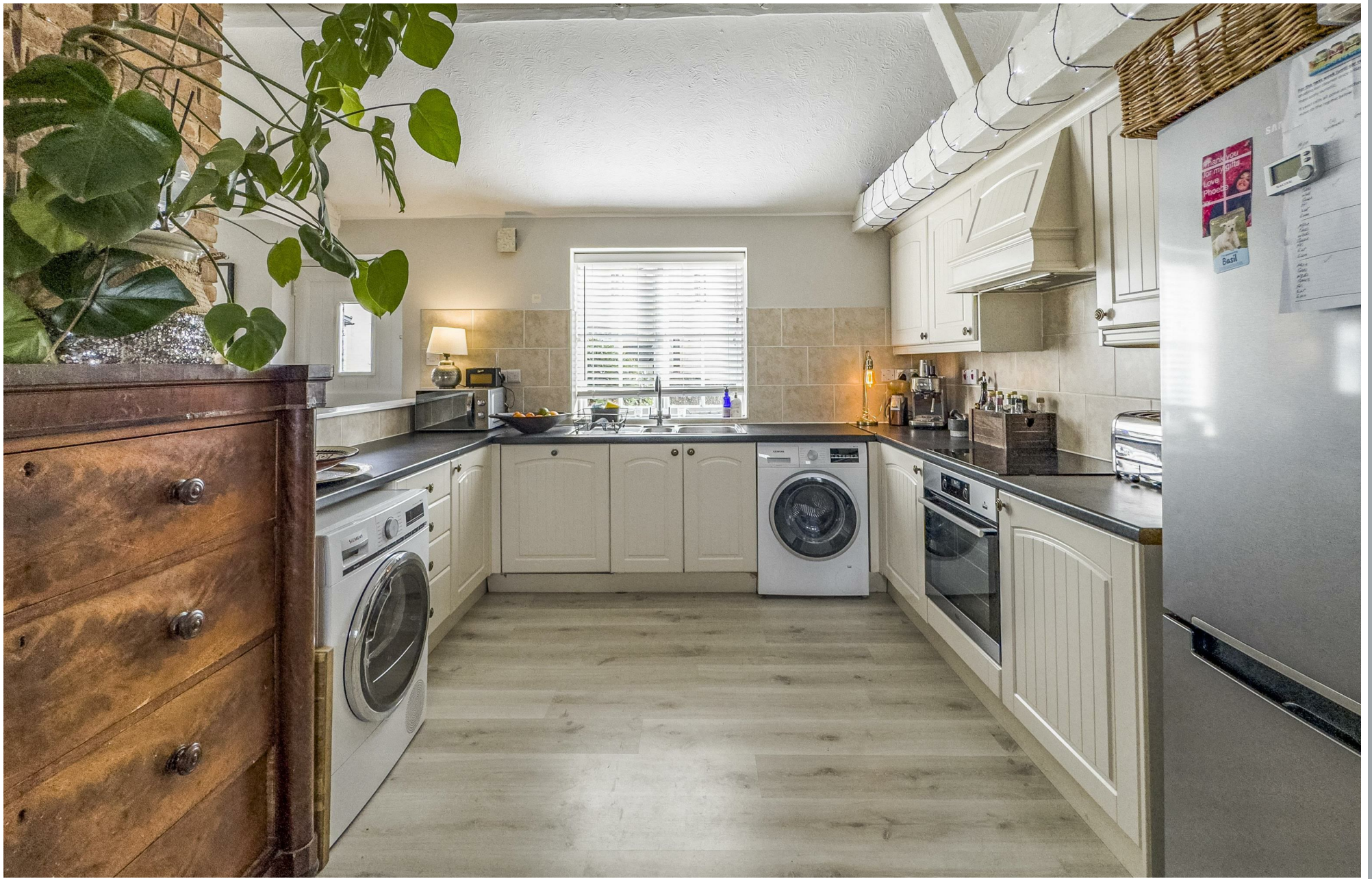
70 Fore Street, Hertford, Hertfordshire, SG14 1BY