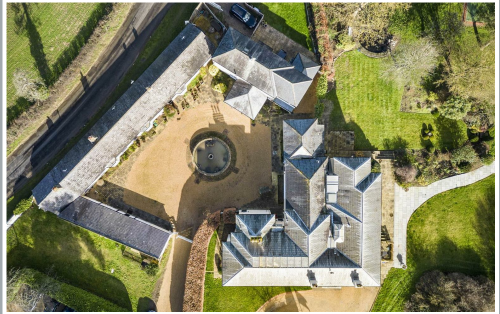
70 Fore Street, Hertford, Hertfordshire, SG14 1BY