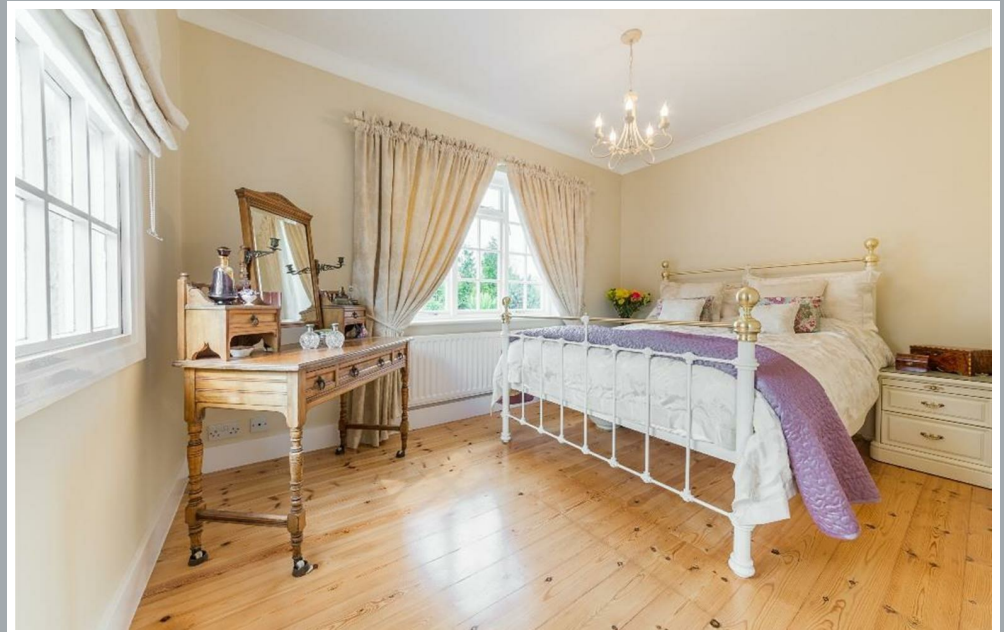
70 Fore Street, Hertford, Hertfordshire, SG14 1BY