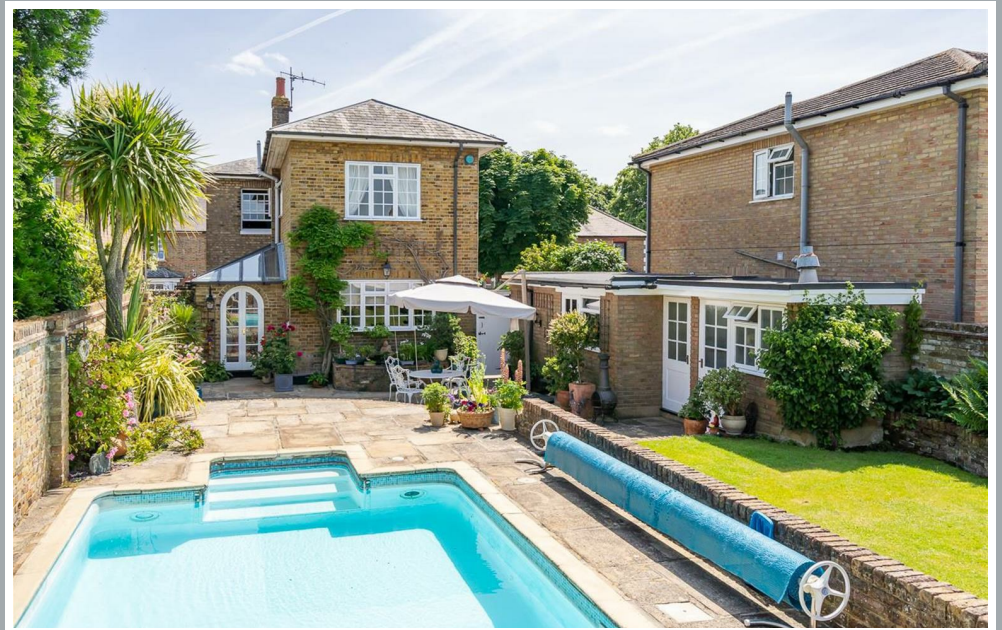
70 Fore Street, Hertford, Hertfordshire, SG14 1BY