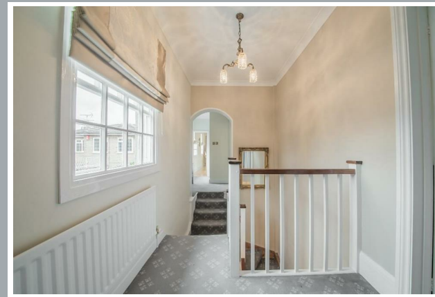
70 Fore Street, Hertford, Hertfordshire, SG14 1BY