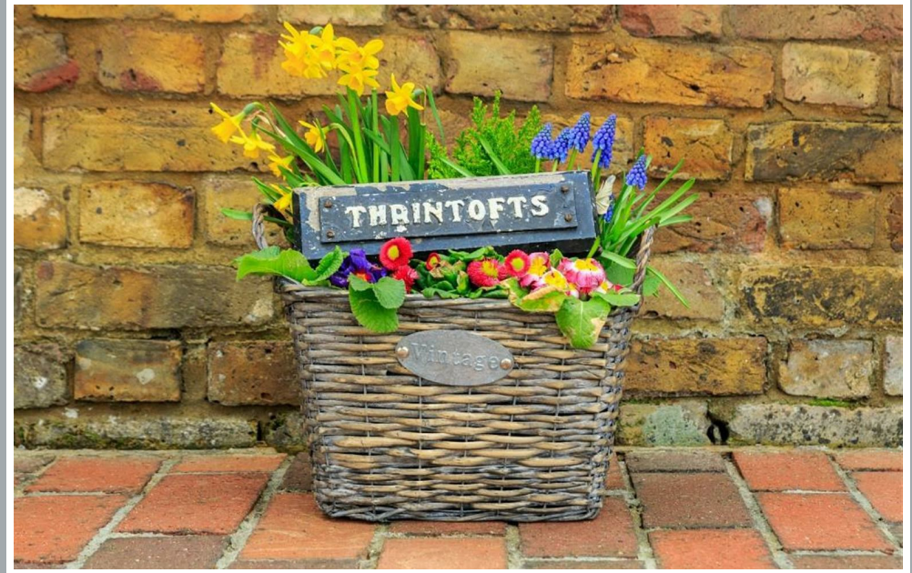
70 Fore Street, Hertford, Hertfordshire, SG14 1BY