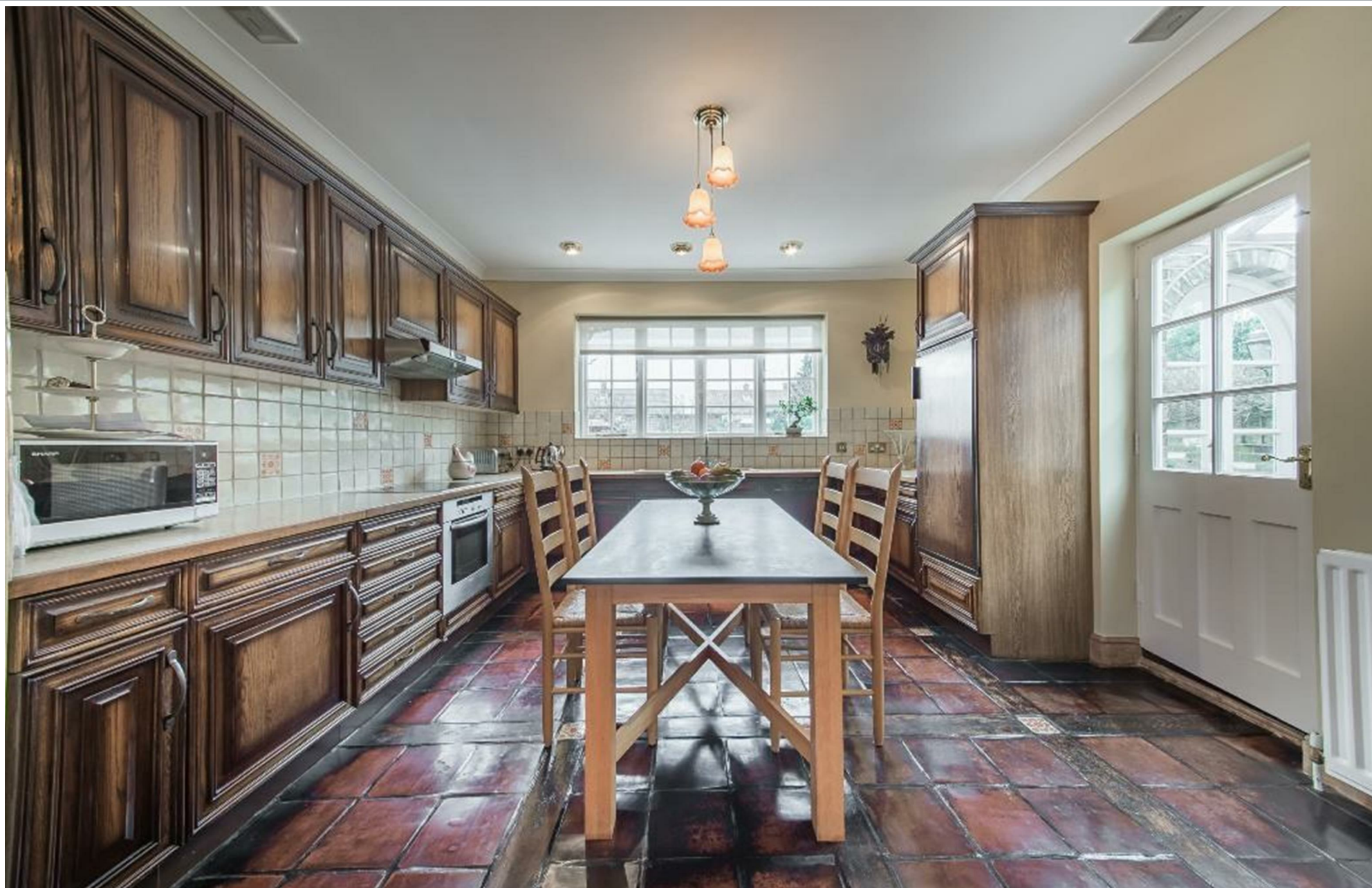
70 Fore Street, Hertford, Hertfordshire, SG14 1BY