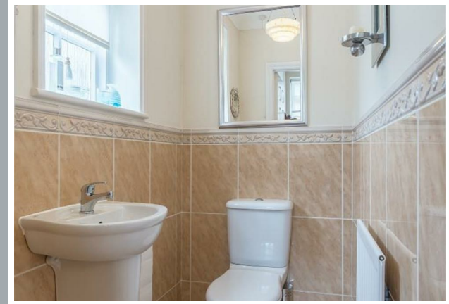
70 Fore Street, Hertford, Hertfordshire, SG14 1BY