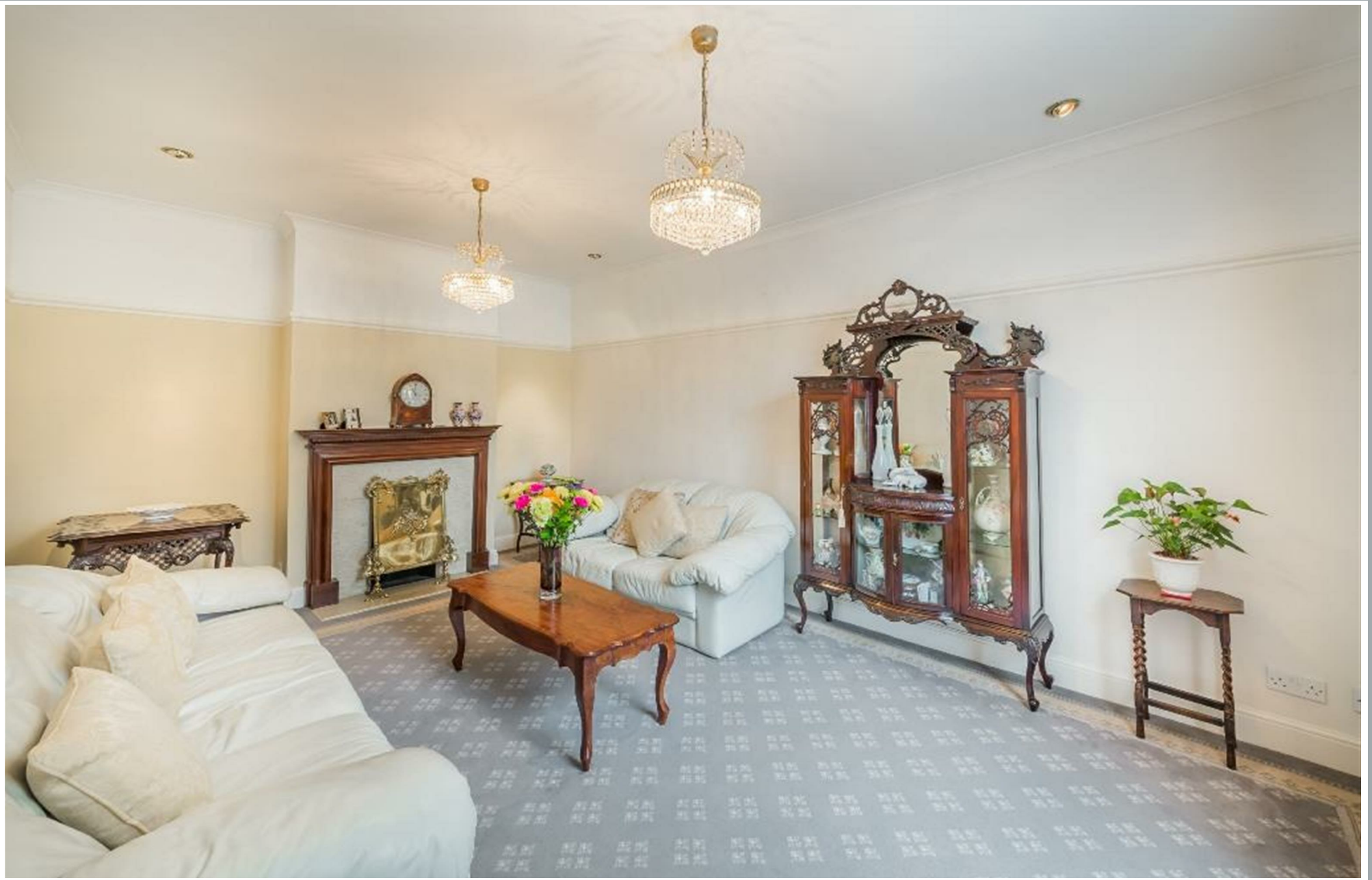
70 Fore Street, Hertford, Hertfordshire, SG14 1BY