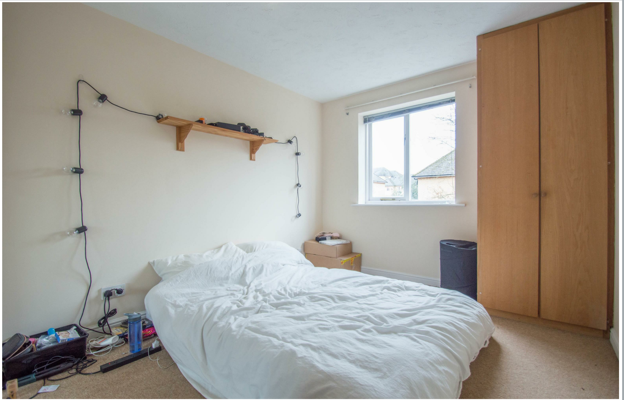
70 Fore Street, Hertford, Hertfordshire, SG14 1BY