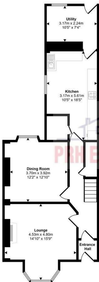
Ground Floor Approx 74 sq m / 795 sq ft

Approx Gross Internal Area 170 sq m / 1831 sq ft