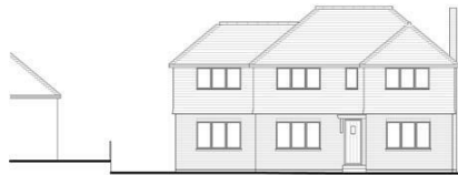
Front Elevation (Street Scene)