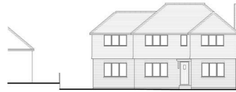
Front Elevation (Street Scene)