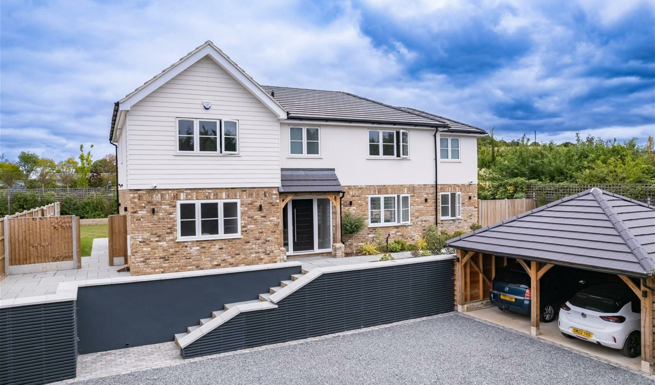
Cedar Lodge, Mott Street, High Beach Asking Price £1,395,000