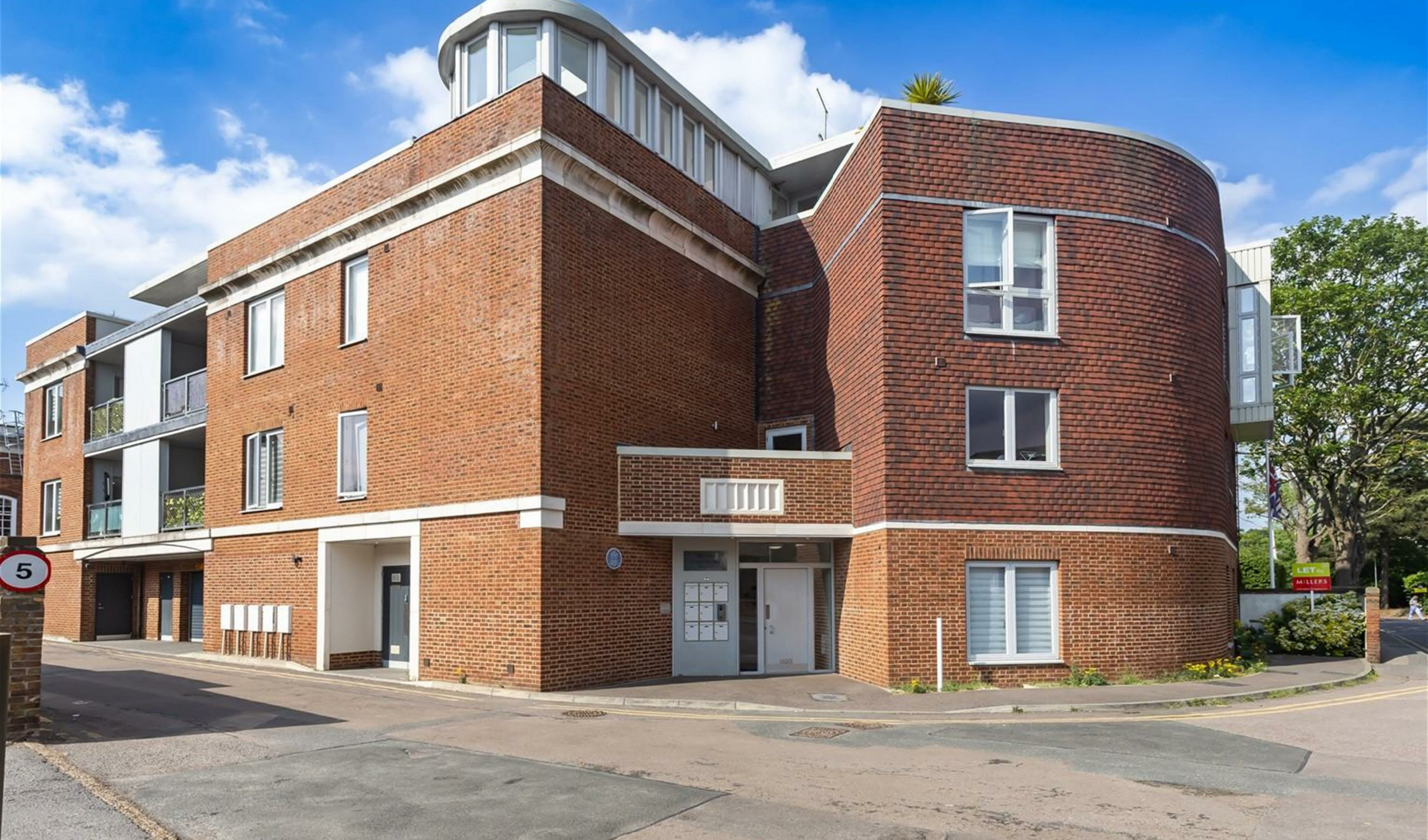
The Old Court House, Star Lane, Epping Asking Price £575,000