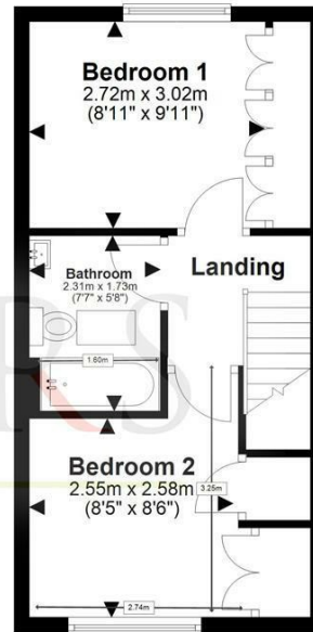
First Floor Approx. 29.1 sq. metres (313.3 sq. feet)