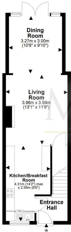
Ground Floor Approx. 40.5 sq. metres (436.1 sq. feet)