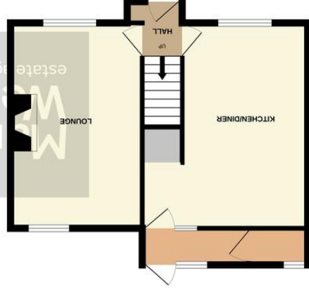
GROUND FLOOR 452 sq.ft. (42.0 sq.m.) approx.