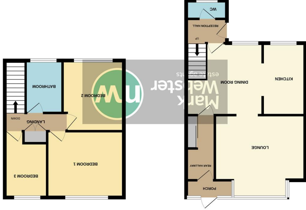
GROUND FLOOR (45.9 sq.m.) approx.

Mon – Fri: 9:00am – 5:30pm Sat: 9:00am – 4:00pm