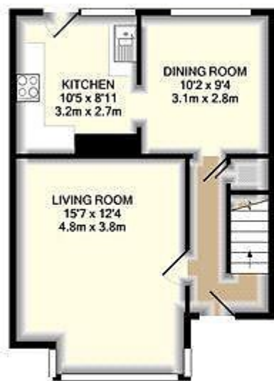
GROUND FLOOR APPROX. FLOOR AREA 433 SQ FT (40.2 SQ.M.)