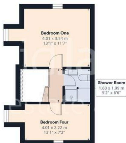
Floor 2 Building 1